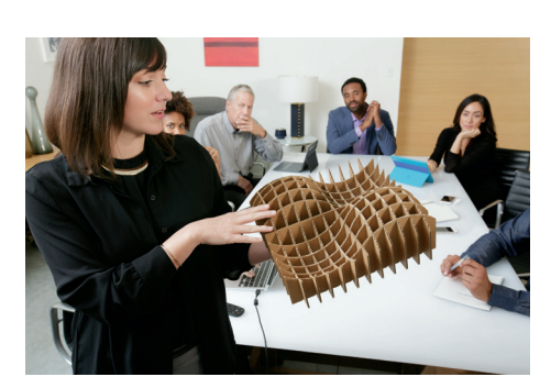
For razor sharp close-ups of objects and whiteboard content, the GROUP camera offers 10x lossless zoom, enabling your team to see every detail with outstanding resolution and clarity.

GROUP offers the flexibility to customize conference room set-up with multiple camera mounting options. Use the camera on the table or mount it on the wall with included hardware. The bottom of the camera is designed with a standard tripod thread for added versatility. Conference participants can also clearly converse within a 6 m/20' diameter around the base, or extend the range to 8.5 m/28' with optional expansion mics.