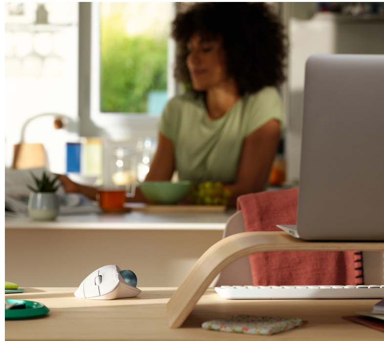
Logitech Ergo M575 Wireless Trackball

laptops are overtaking desktop computers as cubicle culture has given way to hot-desking or collaborating in huddle rooms. Work from home (WFH) is only going to become more entrenched. A 2020 Logitech proprietary study revealed that 67% of workers in the U.S. expect to continue working from home at least twice a week. In Germany and China, the number was 57% and 51% respectively. 5