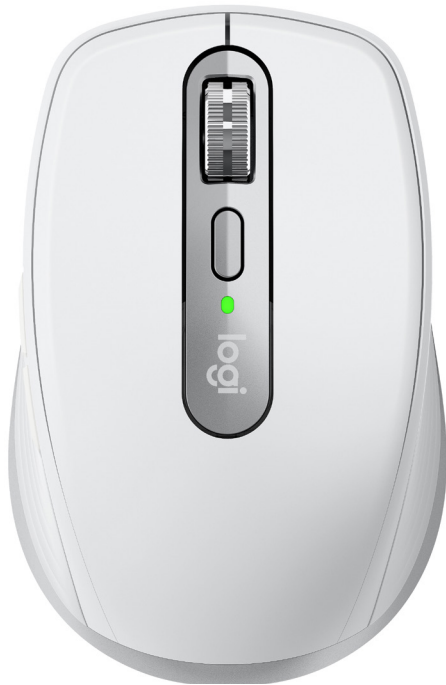
Logitech MX Anywhere 3 Compact Wireless Mouse