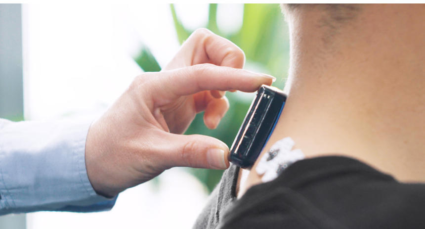
Measuring effects of external mice on posture, The Logi Ergo Lab

The study determined conclusively that workers get more done ... a lot more ... using a mouse versus a built-in trackpad, and with less exertion of the muscles in the neck, shoulder and forearm.