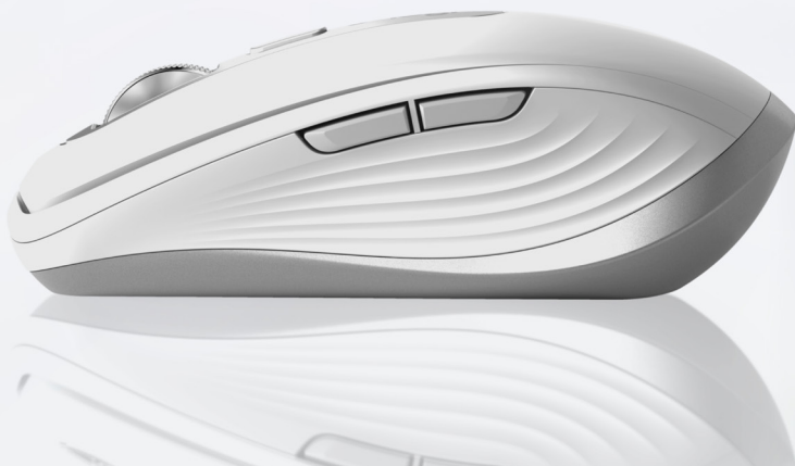
Logitech MX Anywhere 3 Wireless Mouse

The culprit is often a non-ergonomic workspace which can negatively impact productivity. The good news, however, is that simply including an external mouse with a laptop can go a long way toward improving ergonomics in non-conventional setups.