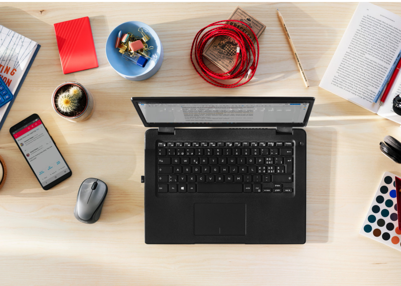
Logitech M310 Wireless Mouse

Among standard equipment issued to workers in corporate settings large and small, the personal computer is undoubtedly the centerpiece in terms of both cost and utility. Tasked with evaluation, sourcing and procurement, IT departments fall under enormous pressure to justify the significant capital expenditure computer purchases entail. Maximising ROI means selecting a computer, operating system and peripherals that enhance employee productivity by equipping them with the proper tools while simultaneously promoting comfort and a sense of well-being.