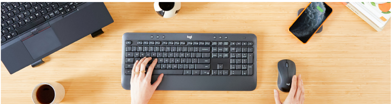
Logitech MK540 Advanced Wireless Keyboard and Mouse Combo

Logitech offers reliable solutions that can cater to any need and workflow with a product portfolio that helps a diverse workforce achieve greater comfort. We understand that one size doesn't fit all and offer mice and keyboards in a variety of shapes and sizes. Durable as they are reliable, our products are quality tested to ensure years of use.