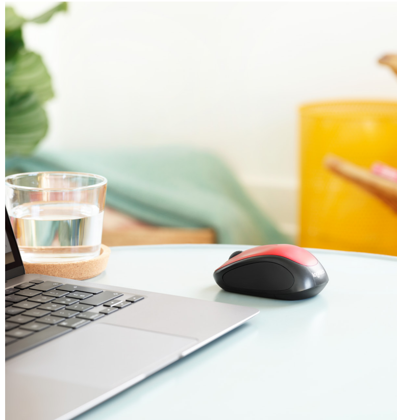
Logitech M317 Wireless Mouse