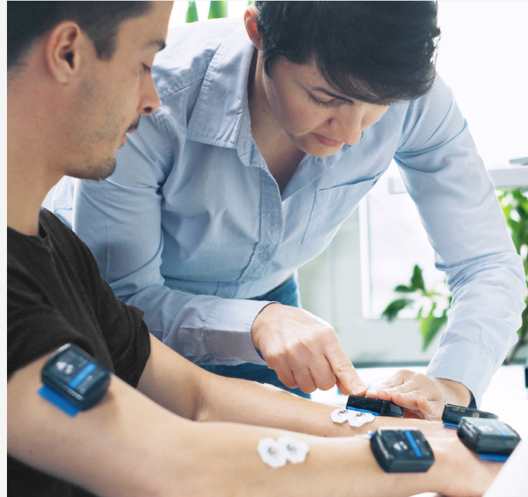
Assessing relative arm positions while using an external mouse vs. a trackpad, The Logi Ergo Lab

To gain a deeper understanding of what actually transpires when using a trackpad or external mouse, Logitech turned to the Logi Ergo Lab. More than a physical space, the Logi Ergo Lab is a human-centered and science-driven approach to designing, developing and reinventing tools that help people feel better at work. It lives at the center of Logitech product development and includes a diverse group of professionals—from engineers to designers to product designers and business groups. The Ergo Lab conducted a study comparing the use of integrated trackpads to external mice with