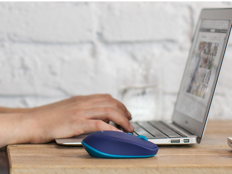
Logitech M535 Wireless Mouse

Sensors attached to the study participants showed that muscles in the neck and shoulder are less activated and therefore more relaxed while using a mouse rather than trackpad. In fact, trackpad users recorded a 45% increase in muscle activity in the neck and shoulder compared to when a mouse was used. Further, 25% more muscle activity in the forearm was detected with trackpad use which can increase fatigue or discomfort.